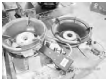
RH31LT Hi Pressure wok HPA100LP