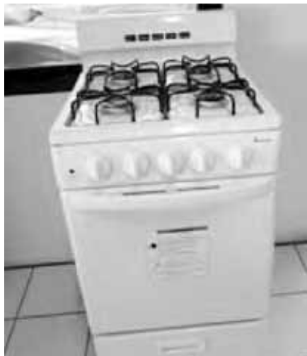
4burners stove run w/9volt.battery ignition. 20inch -AMANA -AGG2200DAAW