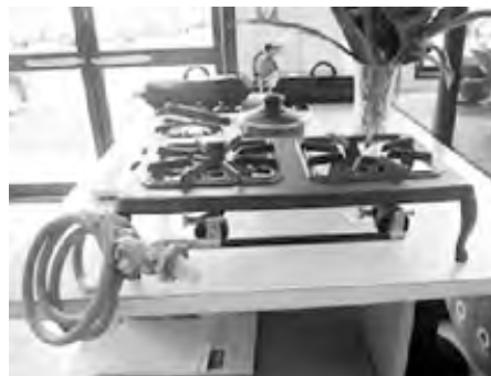
15% discount 2burner cast iron-w/reg& hose GBO2LP Reg price-42.00 Sale Price: $35.70