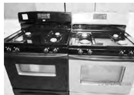
AMANA 30inch four burner stoves