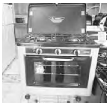
NATEC 2 burner stoves mini oven