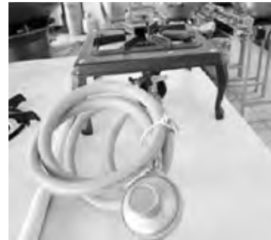
15% discount 1burner cast iron-w/regulator and hose GBO1LP Reg price-27.50 Sale Price: $23.38