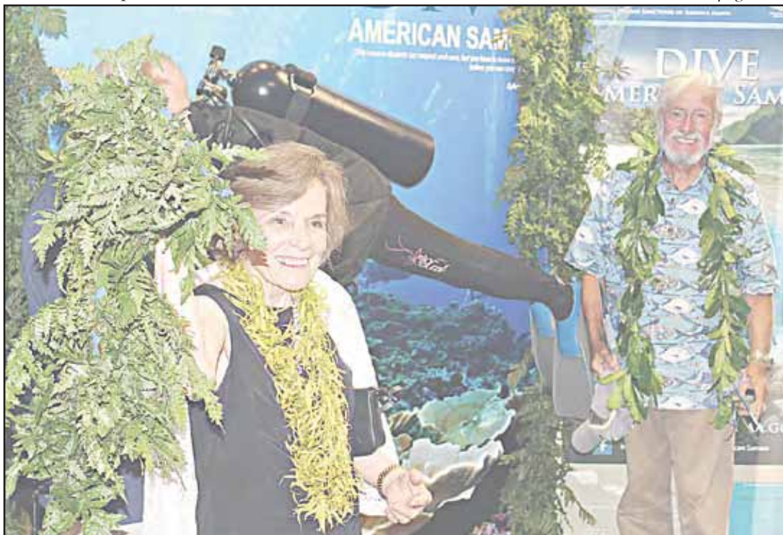
Renowned World Oceanographer, explorer, author, Marine Biologist, 'Her Deepness' Dr. Sylvia Earle raising up an 'ula' of seaweed that was cut as the ribbon for the unveiling of the new exhibit "Scuba Diver" at the Tauese Sunia Ocean Center. Behind Dr. Earle is Senior World Diver Jean Michel Cousteau, renowned ocean explorer and author who helped cut the seaweed-ribbon.